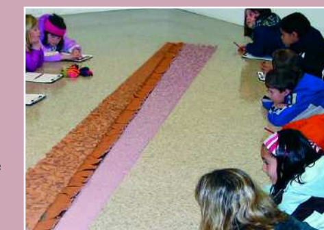
Children ponder the art of Margaret Boozar at the Natural Inclinations show, Jan-Feb 2007.

We will also serve schools with a diverse menu of in-school slide lectures and classroom art projects, after-school art workshops and artist visits to art clubs.