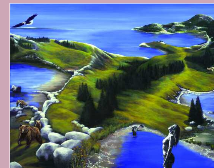
Josephine Haden, No Trespassing, acrylic on canvas, 60 x 76 inches, 2004.

Landscape, fantasy and fairy tale co-exist in these expressive paintings which draw heavily on images from the subconscious and both dark and light universal symbolic content. Color, pattern, texture and other formal compositional elements are explored within the context of the landscape, while mysterious imaginary worlds are seamlessly blended with the familiar.