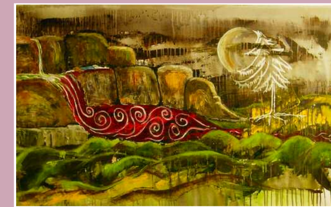
Joy Every, Blood of an Innocent, acrylic on canvas, 51 x 53-1/2 inches, 2007.

In these diminutive paintings, Washington artist Karey Kessler strives to capture the mystical, the conceptual, the poetic and the mundane. Reminiscent of treasure maps, yet leading to no specific location, these images evoke the conceptual landscape of both mind and memory.